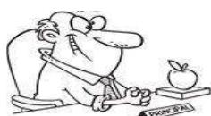
Go to the Principal's Office